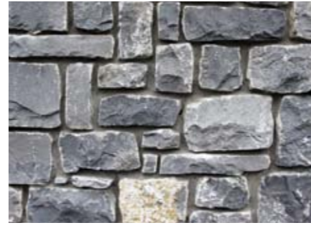
▲ White Limestone