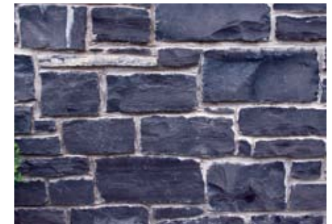
▲ Nova Black

*Stone is a natural product and is subject to colour variations*