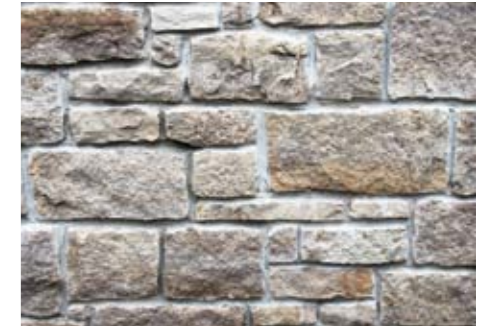
▲ Grit Sandstone