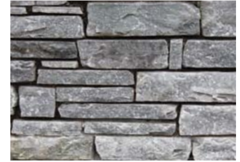
▲ Silver Quartzite