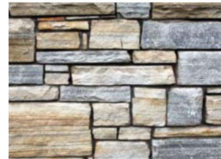
▲ Silver & Gold Quartzite