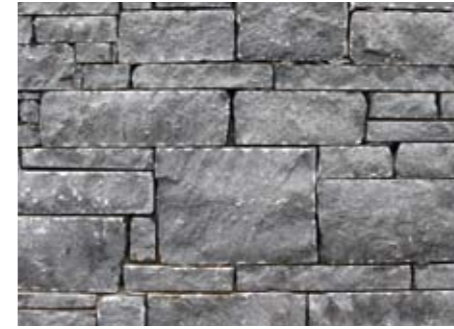
▲ Blue Limestone