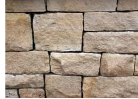
▲ Mountcharles Sandstone