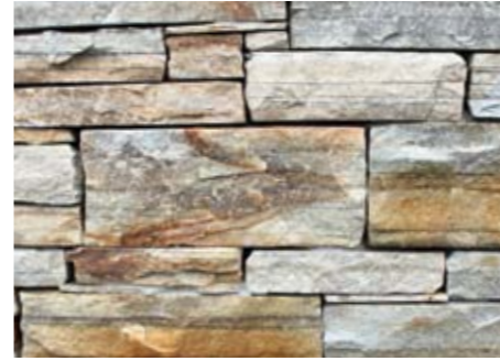
▲ Gold Quartzite